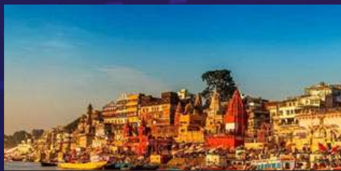
Varanasi – The city of Lights