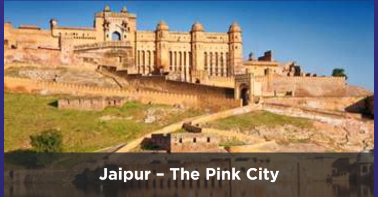
Jaipur – The Pink City