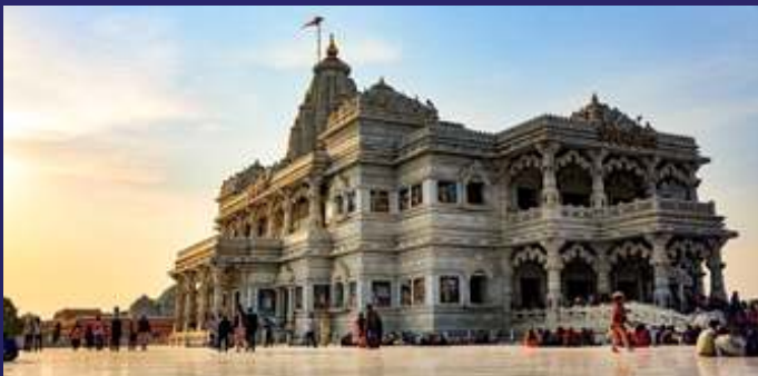
Mathura and Vrindavan – Birthplace and childhood abode of Lord Krishna