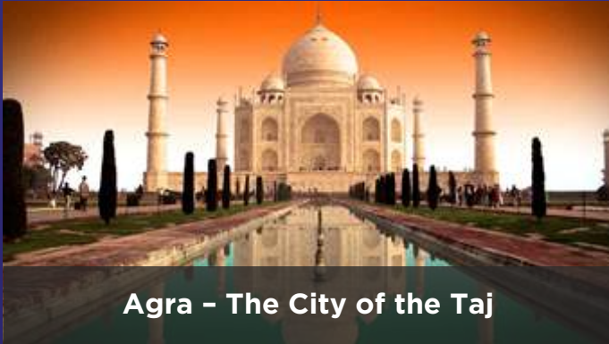
Agra – The City of the Taj