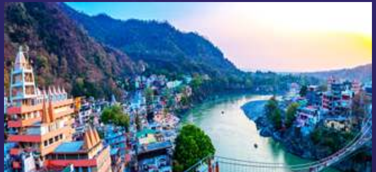
Rishikesh The ‘Yoga Capital of the World’